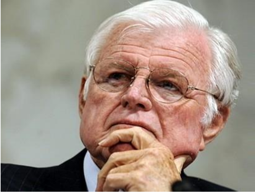
Sen. Ted Kennedy, D-Mass.