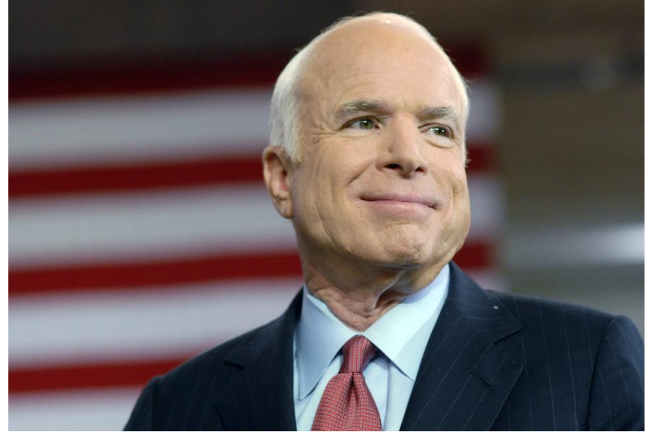
Sen. John McCain, R-Ariz.