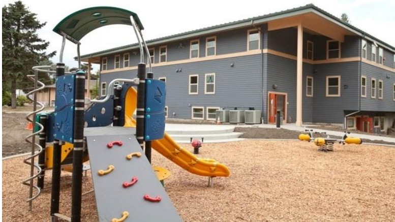
Passage Point – 46 units of Project-based subsidy Serves parents exiting the criminal justice system reunifying with their children

eliminating racism empowering women ywca