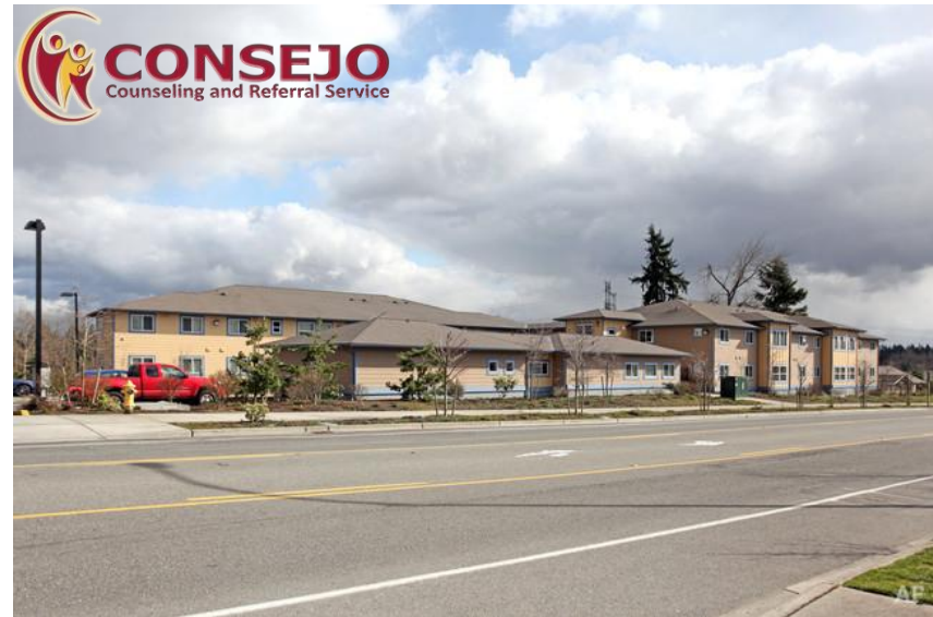
Villa Esperanza – 23 units of Project-based subsidy Serves survivors of domestic violence and their children